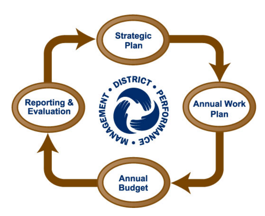
Figure 1-2. The District's annual performance management cycle.

As presented in Volume II, Chapter 2, the Annual Work Plan Report (also known as the 4<sup>th</sup> Quarter Report) is central to the "reporting and evaluation" step of the District's business cycle. In the 2011 SFER, the Annual Work Plan Report serves to evaluate agency compliance with the other elements of the cycle for FY2010, including the District's Strategic Plan, Annual Work Plan, and Budget. The 2011 SFER also provides detailed reporting on many of the agency's strategic objectives, success indicators, and deliverables and milestones across programs. An overview of the connections between the agency's programs and the SFER is presented in Table 1-3 of the 2009 SFER – Volume I, Chapter 1.