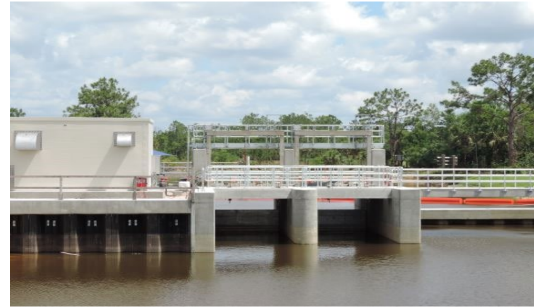
Golden Gate 4 Structure