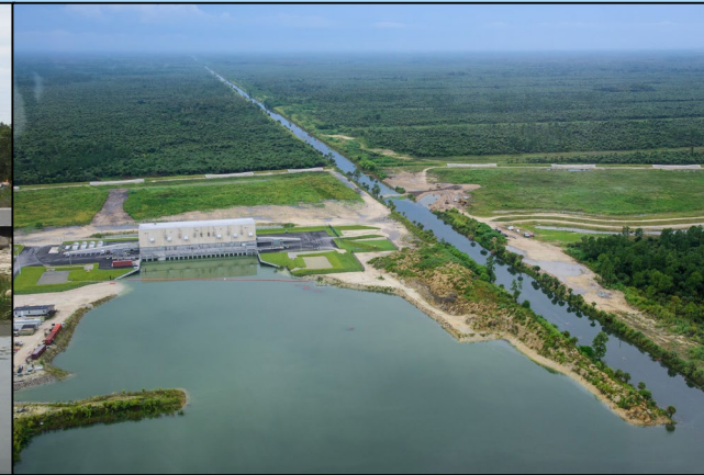
Faka Union Pump Station