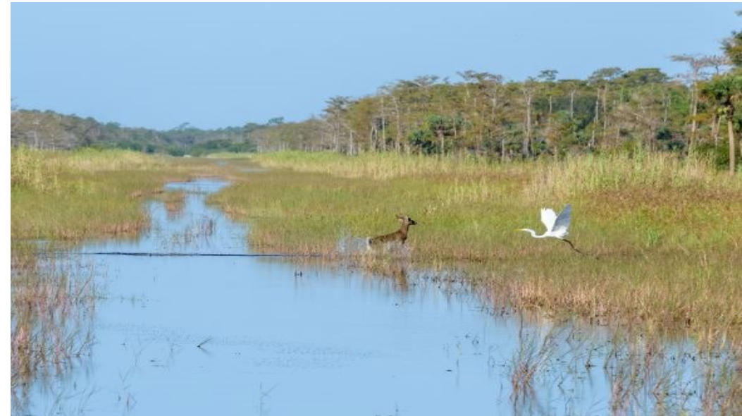
Wildlife in Picayune Strand