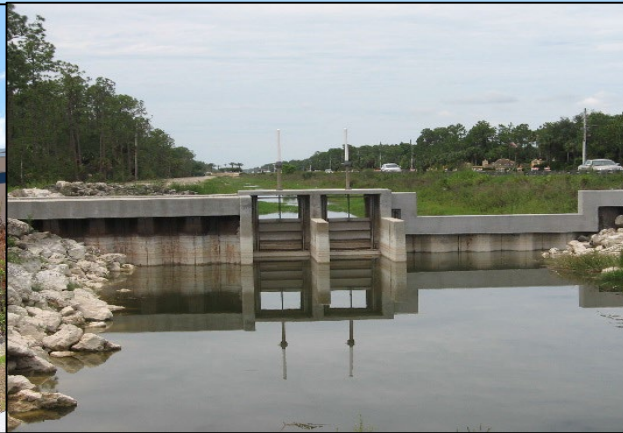
Henderson Creek Structure 2