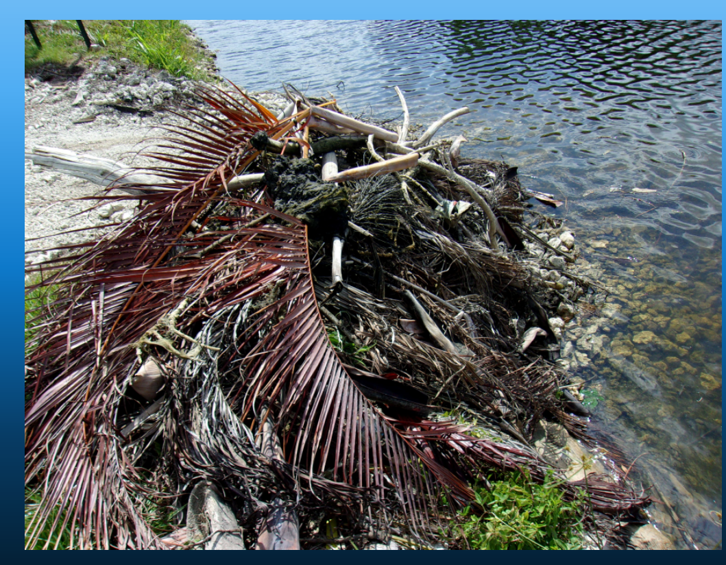
Golden Gate canal (GG1)