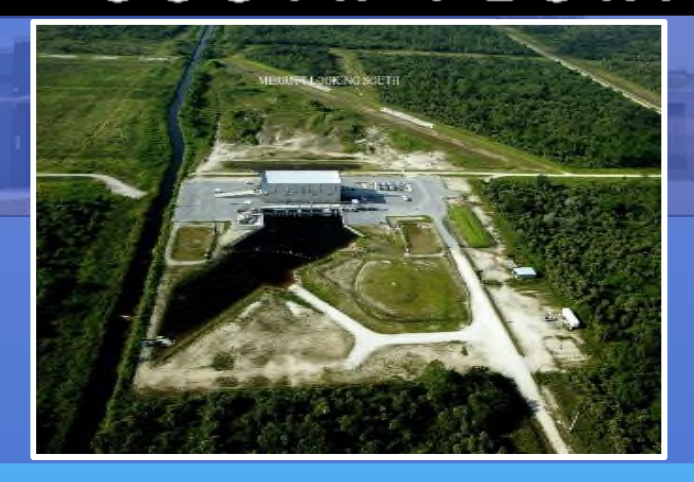
MERRIT Pump Station PS-488