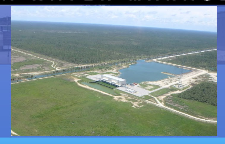
FAKA Pump Station PS-487