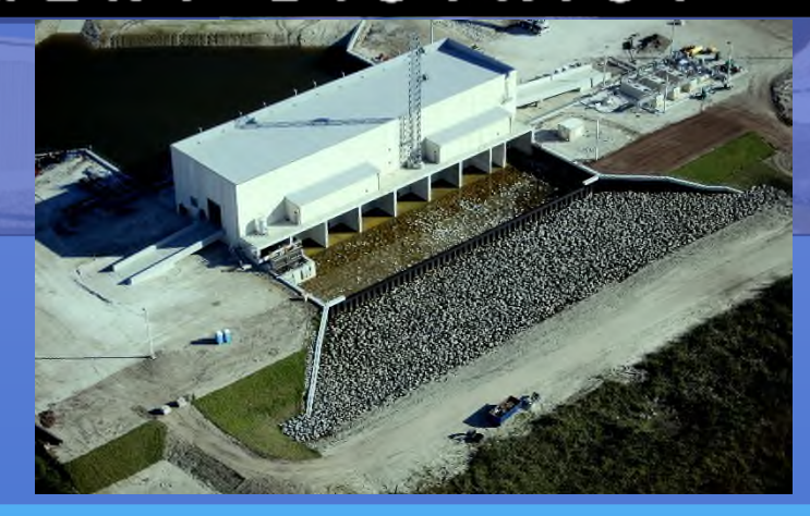
MILLER Pump Station PS-486