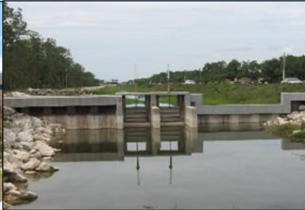
Henderson Creek Structure 2