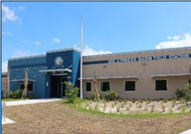
Big Cypress Basin Field Station