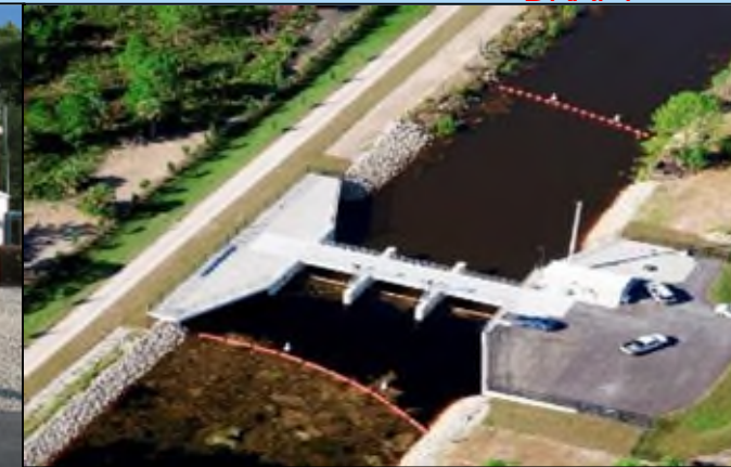
Golden Gate Structure 3 (GG3)