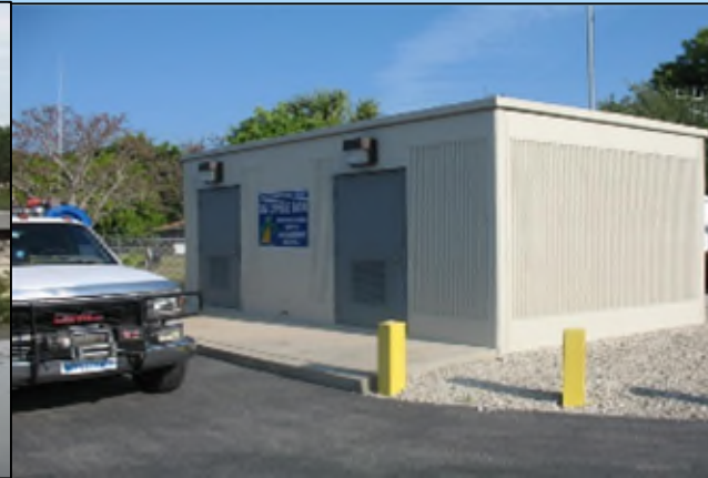
Control room for Cocohatchee Structure 1