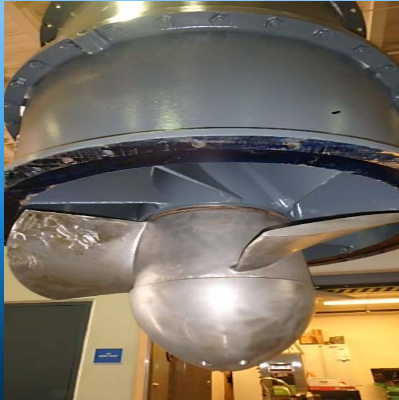
Shaft/ Impeller Assembly