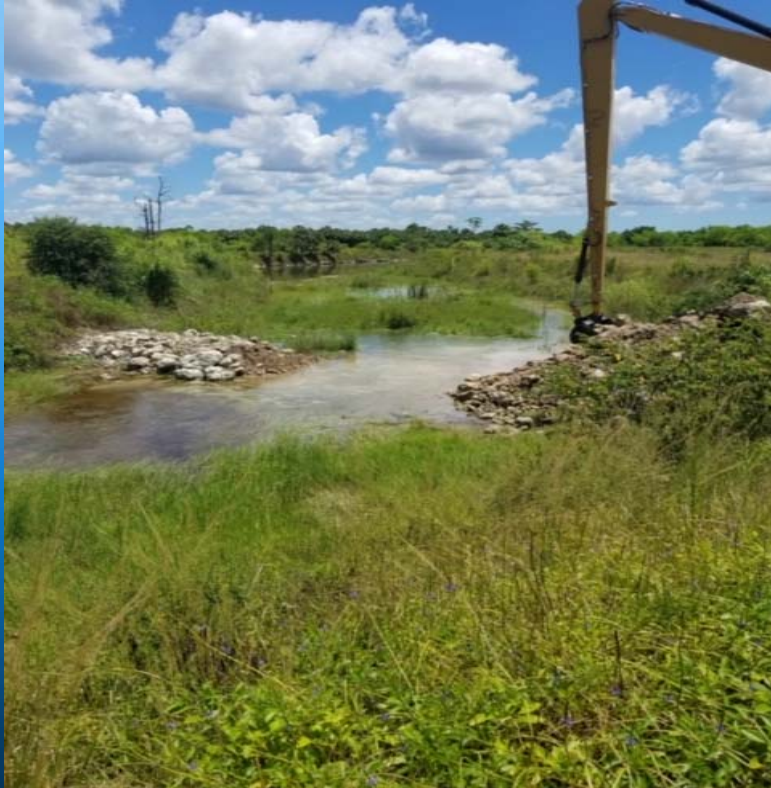
FAKA By-Pass Plug Removal