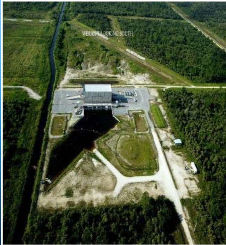
Merrit Pump Station