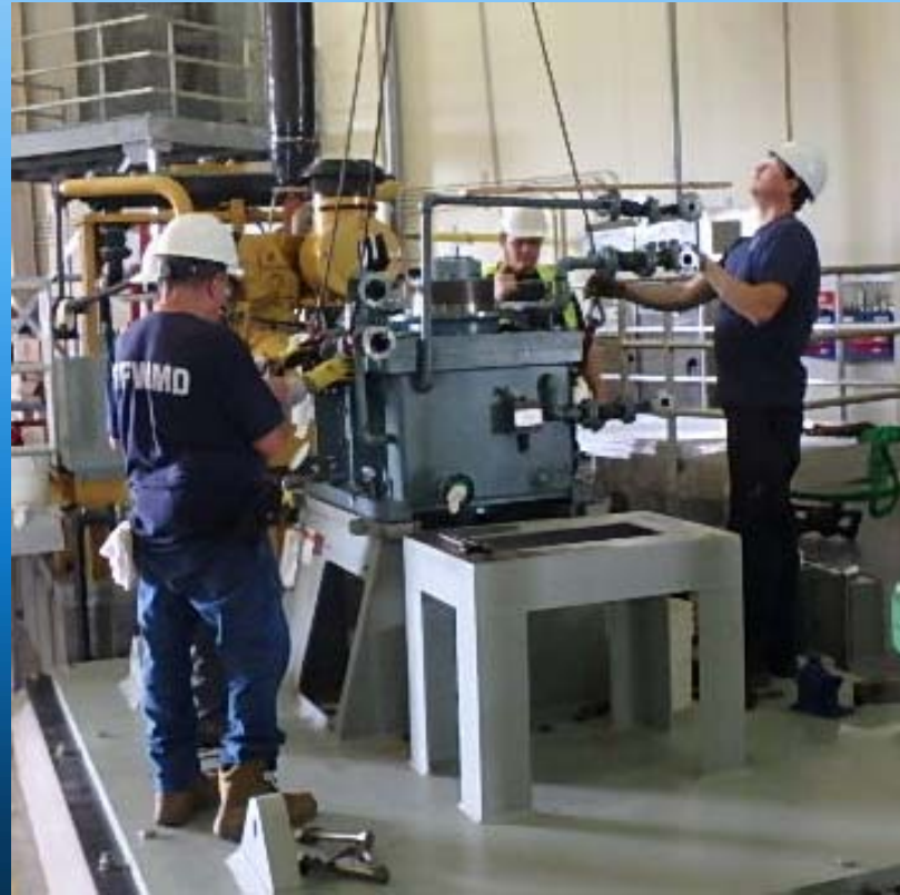
Power Take Off (PTO)