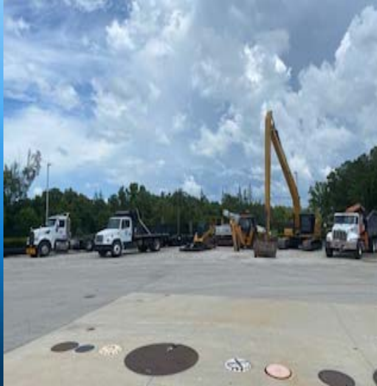
All Equipment Staged at FS