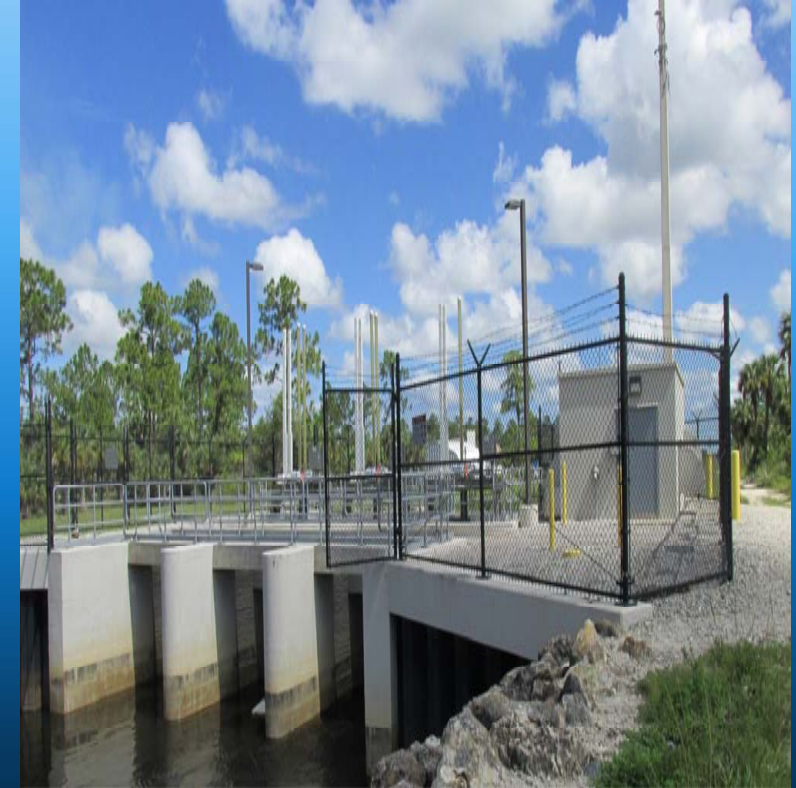
Generator Structures, Miller #3

Storm Activities Presenter: Juan Bethencourt