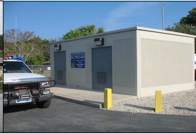
Control room for Cocohatchee Structure 1