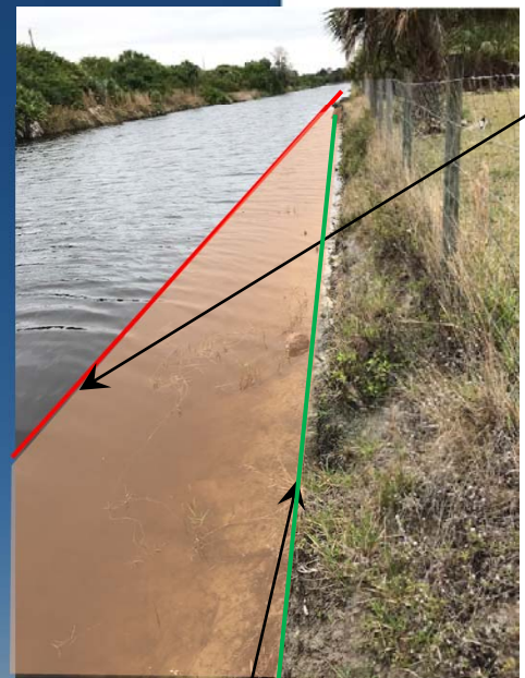
Faka Union Canal (2020)