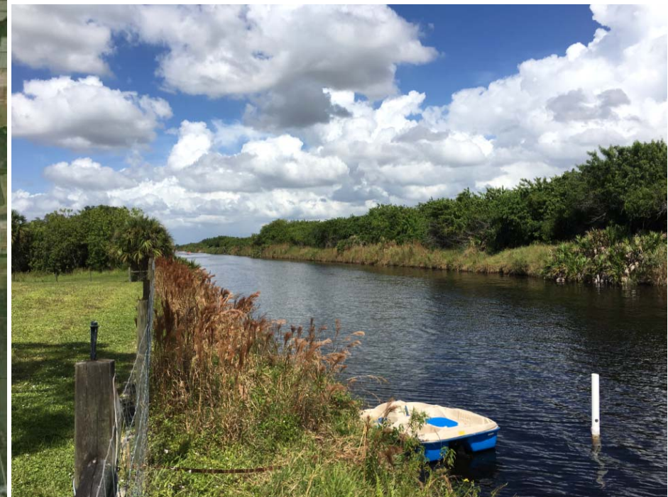
Faka Union Canal (2010)