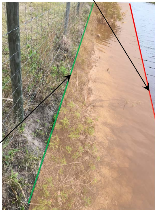
Top of Bank (2010)