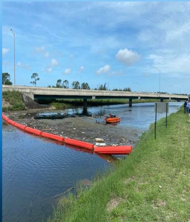
During I-75 #1 Weir Canal Maintenance