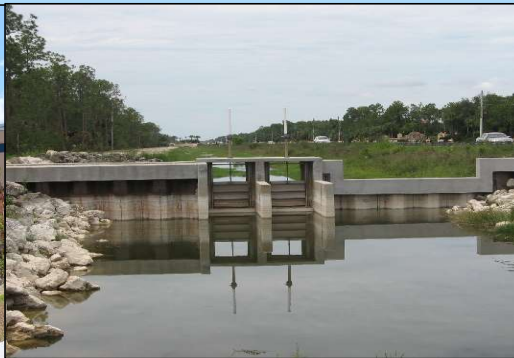
Henderson Creek Structure 2