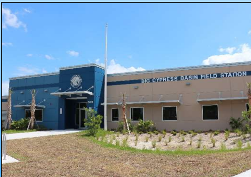
Big Cypress Basin Field Station