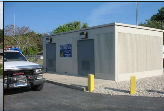
Control room for Cocohatchee Structure 1