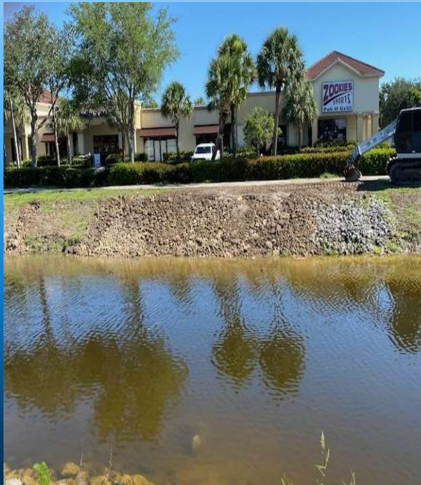
During Cocohatchee Canal Maintenance