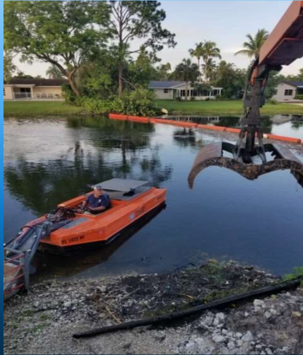
During GG1 Structure Canal Maintenance