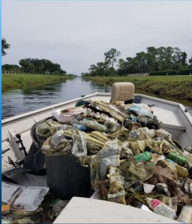
During 951 Canal Maintenance