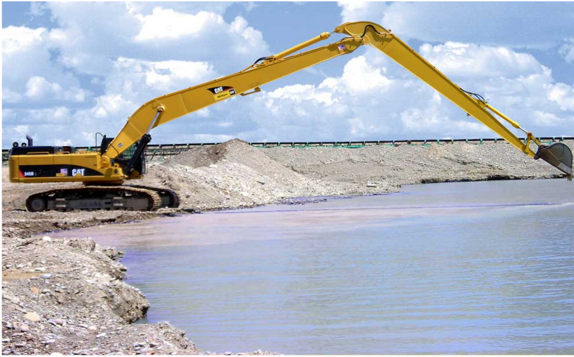
Excavator, Track Hoe, Long Arm Estimated Delivery Time: March 2020