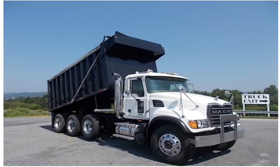
Truck 18 cu-yd, Dump, Tri-axle Estimated Delivery Time: February 2021