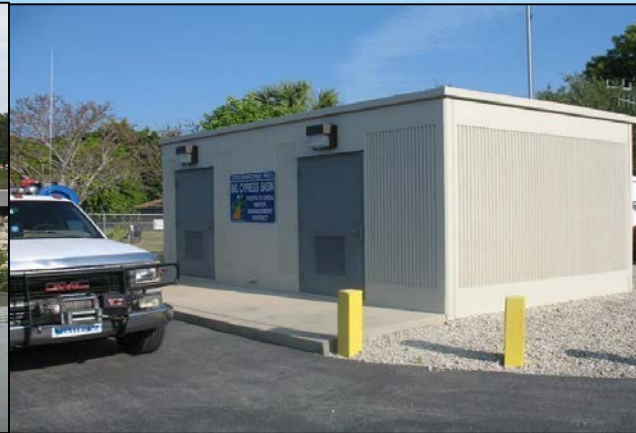
Control room for Cocohatchee Structure 1