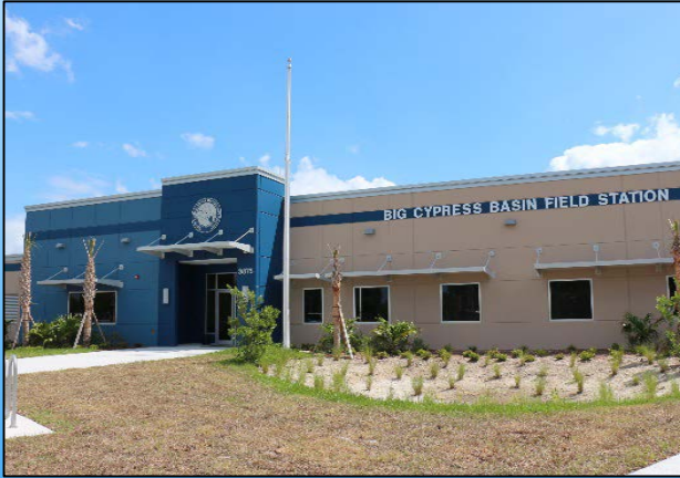
Big Cypress Basin Field Station