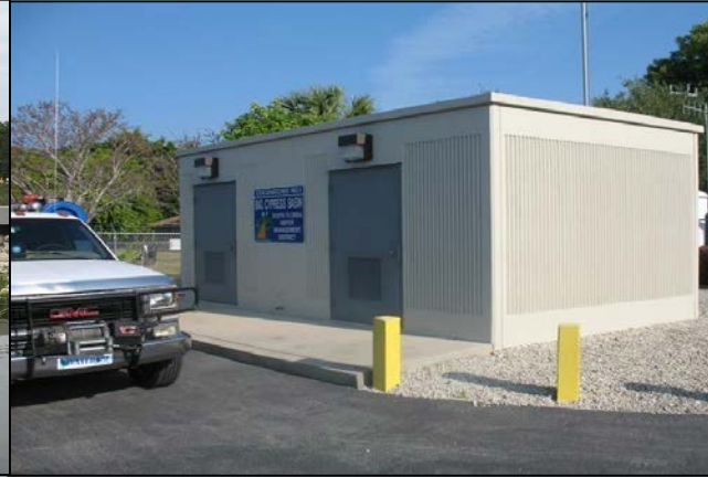
Control room for Cocohatchee Structure 1