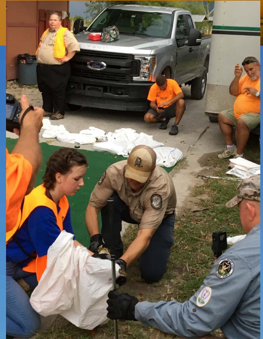
YHPF Python Training