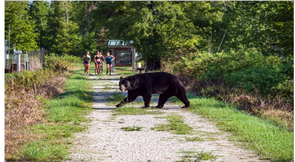
Bear at Bird Rookery Swamp (CREW)