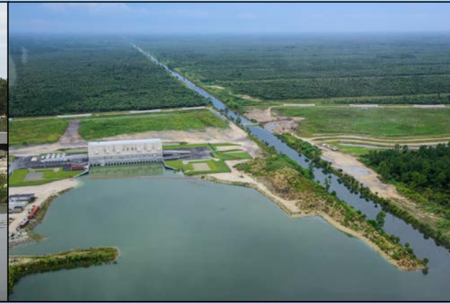
Faka Union Pump Station