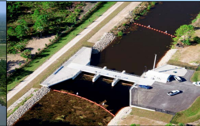
Golden Gate Structure 3 (GG3)