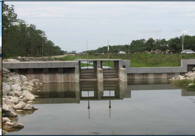
Henderson Creek Structure 2