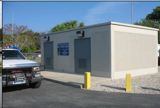
Control room for Cocohatchee Structure 1