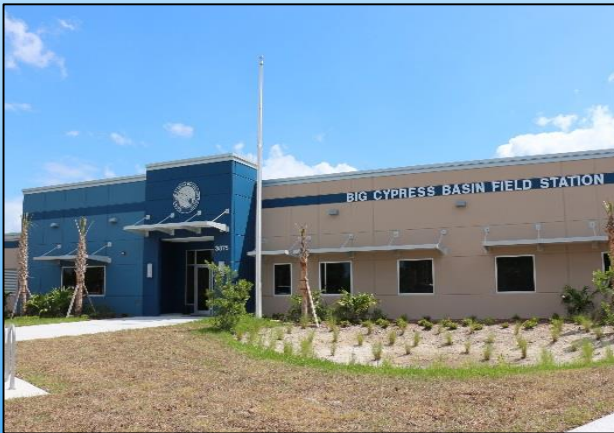
Big Cypress Basin Field Station