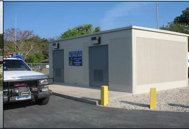
Control room for Cocohatchee Structure 1