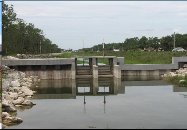
Henderson Creek Structure 2