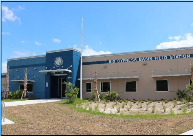
Big Cypress Basin Field Station