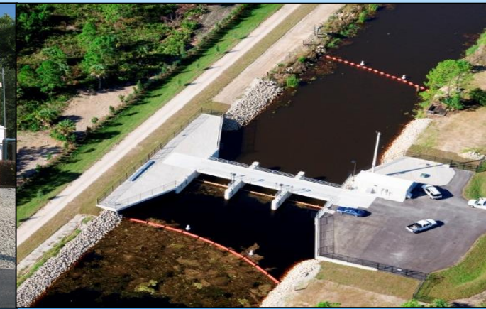
Golden Gate Structure 3 (GG3)