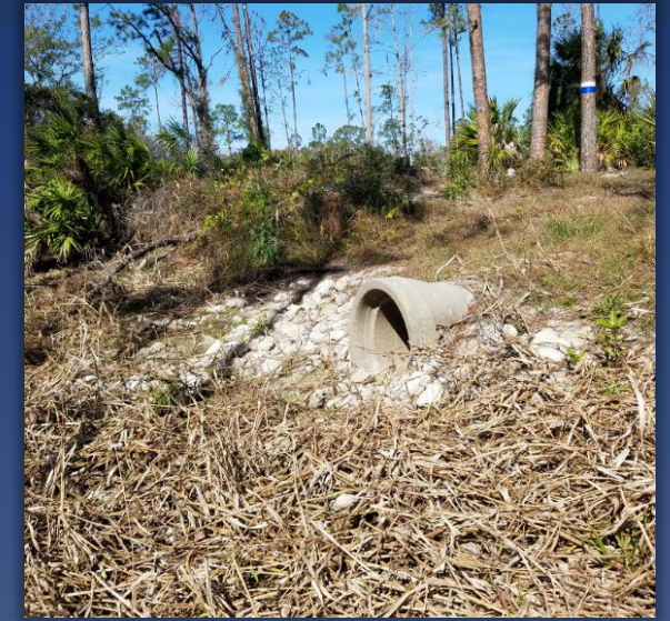
Lee County – Six Mile Cypress Slough Restoration - culvert structure to convey water to spreader swale