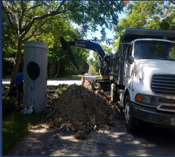
Village of Pinecrest – stormwater improvement project - exfiltration trench during installation