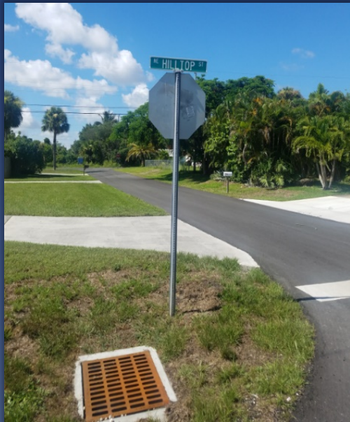
Martin County – Hilltop water quality retrofit project - catch basin inlets installed