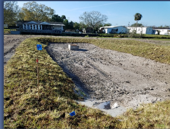
Okeechobee – Centennial Park stormwater retention pond