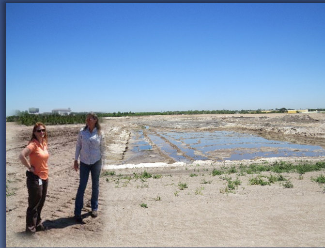
Osceola County – Judge Farms Reservoir Phase 1